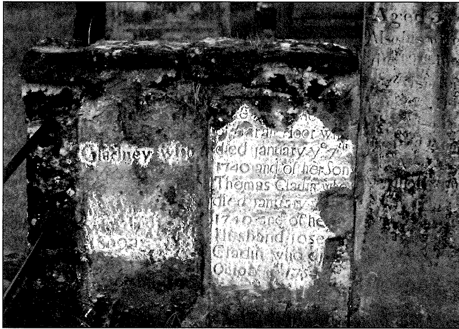
Above: 1997 photo of the Gladney graves in Ballymena. Below: 2013 photo of the same graves.